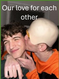
Our love for each other