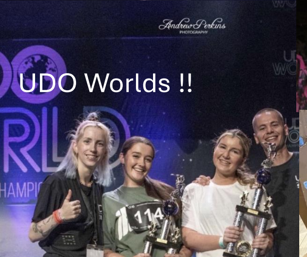
UDO Worlds !!