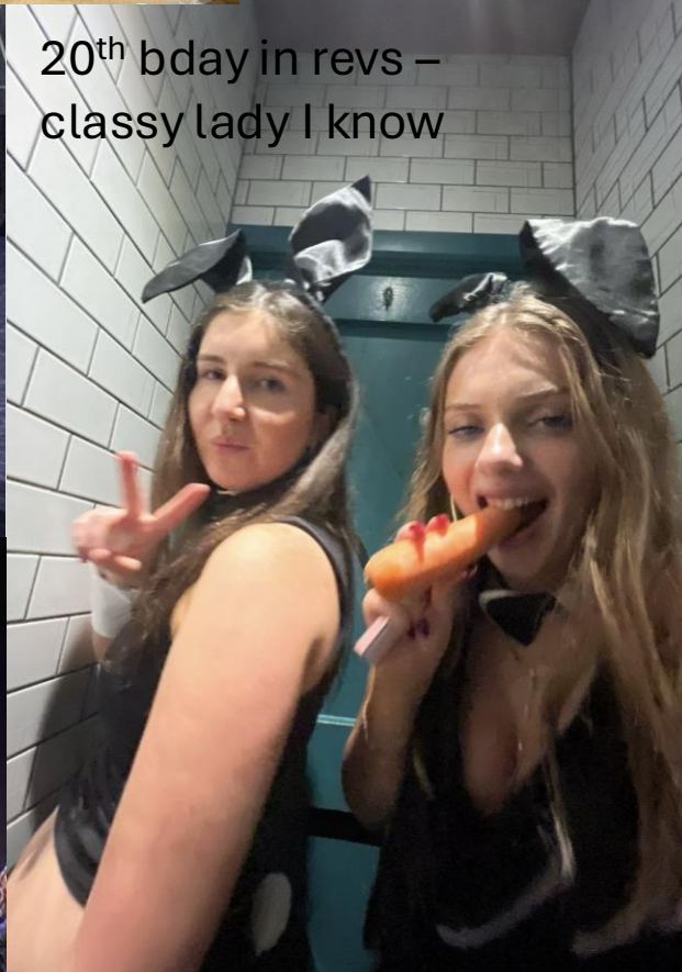
20 th bday in revs – classy lady I know