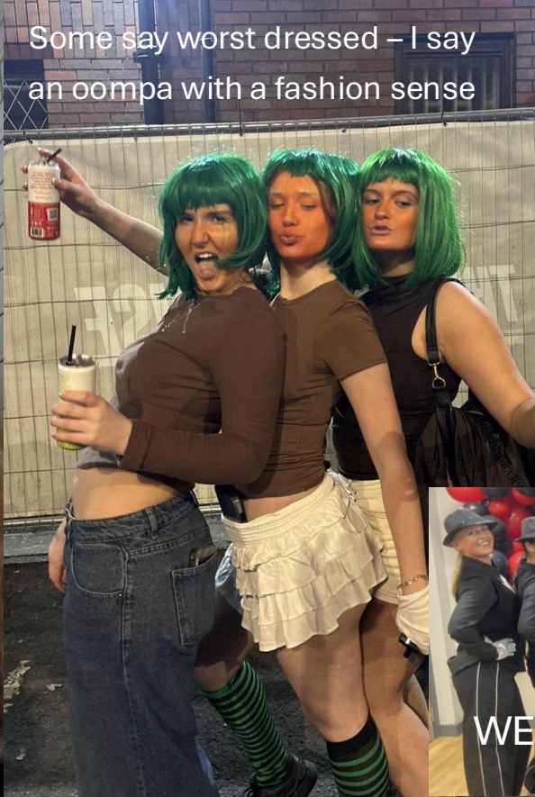
Some say worst dressed – I say an oompa with a fashion sense