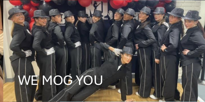
WE MOG YOU