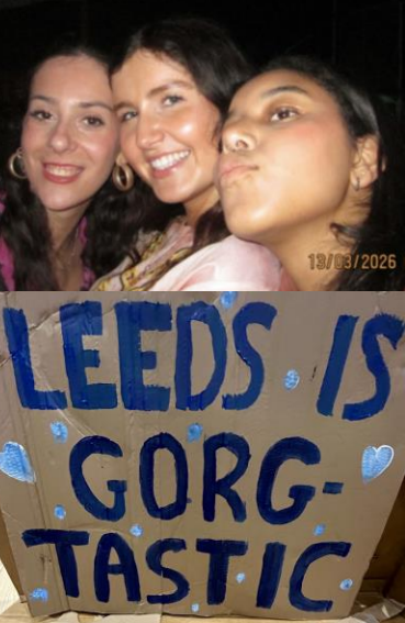
LEEDS IS GORG-TASTIC