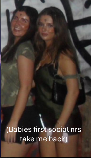
(Babies first social nrs take me back)