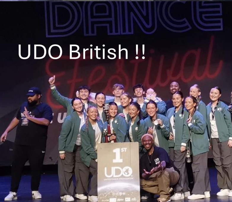
UDO British !!