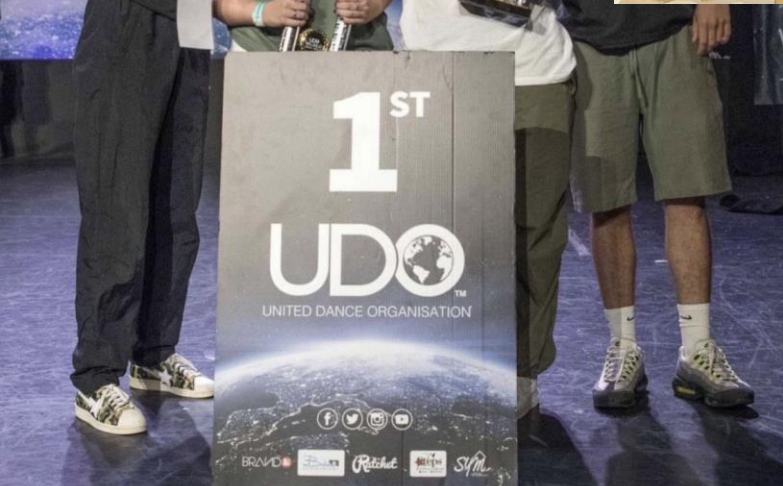
1 ST UDO UNITED DANCE ORGANISATION