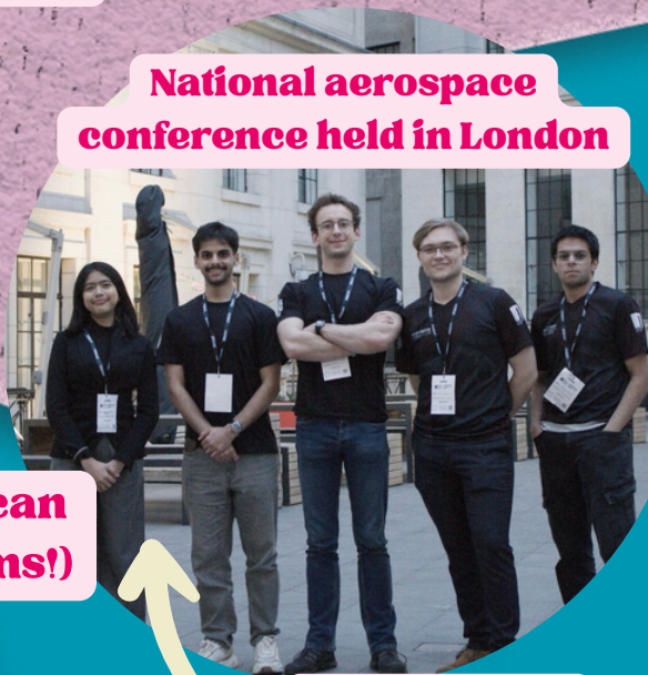
National aerospace conference held in London